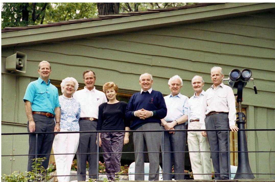
The principals gathered for a group photo at Camp David, all smiles except for the Soviet marshal at right. From left, Baker, Barbara Bush, President Bush, Raisa Gorbacheva, President Gorbachev, Shevardnadze, Scowcroft, Akhromeyev. June 2, 1990.