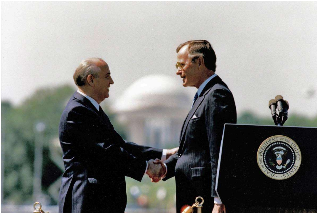
The Washington summit arrival on May 31, 1990, featured high ceremony on the White House lawn, here with formal greetings from President Bush for Mikhail Gorbachev, now president of the USSR.

Washington D.C., December 12, 2017 – U.S. Secretary of State James Baker’s famous “not one inch eastward” assurance about NATO expansion in his meeting with Soviet leader Mikhail Gorbachev on February 9, 1990, was part of a cascade of assurances about Soviet security given by Western leaders to Gorbachev and other Soviet officials throughout the process of German unification in 1990 and on into 1991, according to declassified U.S., Soviet, German, British and French documents posted today by the National Security Archive at George Washington University ( http://nsarchive.gwu.edu ).