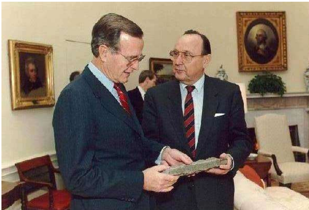
Foreign Minister Genscher presents President Bush with a piece of the Berlin Wall, Oval Office of the White House, Washington, D.C., November 21, 1989.