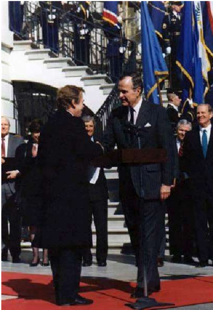
President Bush greets Czech President Vaclav Havel outside the White House, Washington, D.C., February 20, 1990.