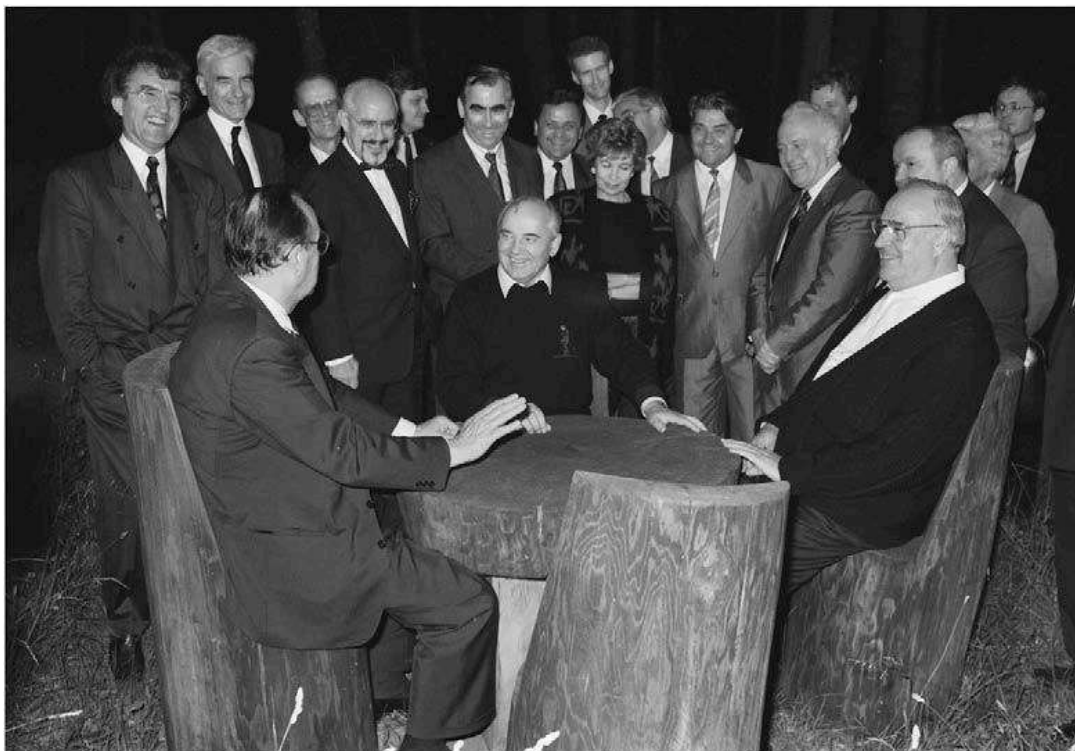
Michail Gorbachev discussing German unification with Hans-Dietrich Genscher and Helmut Kohl in Russia, July 15, 1990.